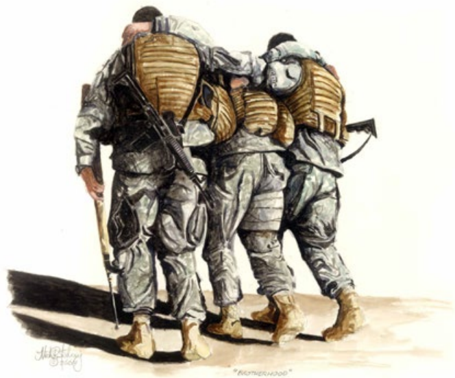
Brotherhood (2007), watercolor on canvas