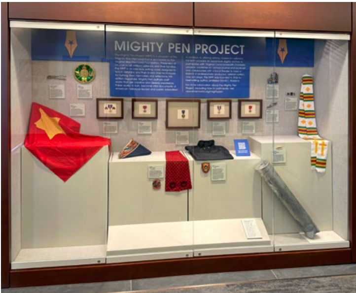
Visit the Mighty Pen Project website to learn more about these stories. VaWarMemorial.org/MightyPenProjectExhibit

Fourteen veterans who have participated in the Memorial's writing program, the Mighty Pen Project, have donated artifacts from their service careers to be on long-term display. Medals, personal articles, even a twisted bit of steel from a truck destroyed by an IED in Baghdad, bring home some of the stories written for the Mighty Pen. The exhibit includes a captured North Vietnamese battle flag, a religious stole worn by one of the first female Marine chaplains to cross enemy lines to chase down Saddam Hussein, two Silver Stars, and the Purple Heart awarded to the son of one Mighty Pen writer for giving his life in Iraq. The display is a powerful reminder of the service and sacrifices the people of our American military make around the world.