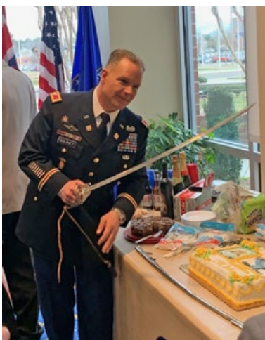
Colonel Solovey's promotion ceremony at Norfolk Naval Base at Allied Command Transformation NATO Headquarters in 2020.

Seeking a different kind of challenge, Solovey decided to attend the Virginia Military Institute (VMI), where he majored in modern languages (French, German, and Spanish) while pursuing all available art courses to earn a minor in fine arts. During his junior