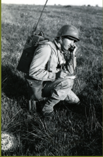
Exhibit Design: The 1717 Design Group, Inc.

The lessons of World War II — those learned from triumphs as well as losses — will be forgotten without the efforts of organizations like the Virginia War Memorial to keep the memories, the sights, and the sounds in the public consciousness.