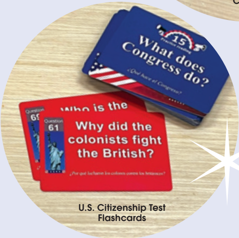
U.S. Citizenship Test Flashcards

Visit the Memorial Store to find these and other great holiday gifts!