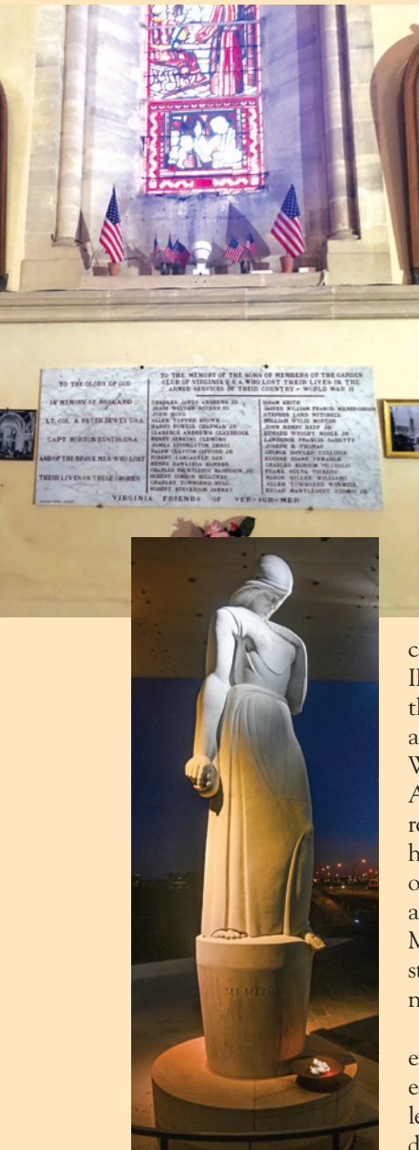
TOP: The plaque in the 12th-century Church of St. Martin in Ver-sur-Mer commemorating the gift from the Garden Club of Virginia for the restoration of the stained glass windows in the nave of the church following military action on D-Day.