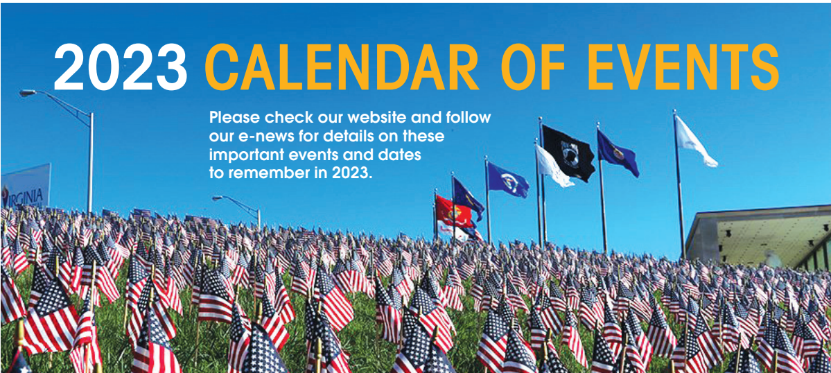
Hill of Heroes flag display, held each June

January 27 New Exhibition Opening “50 Years Beyond: The Vietnam Veteran Experience”