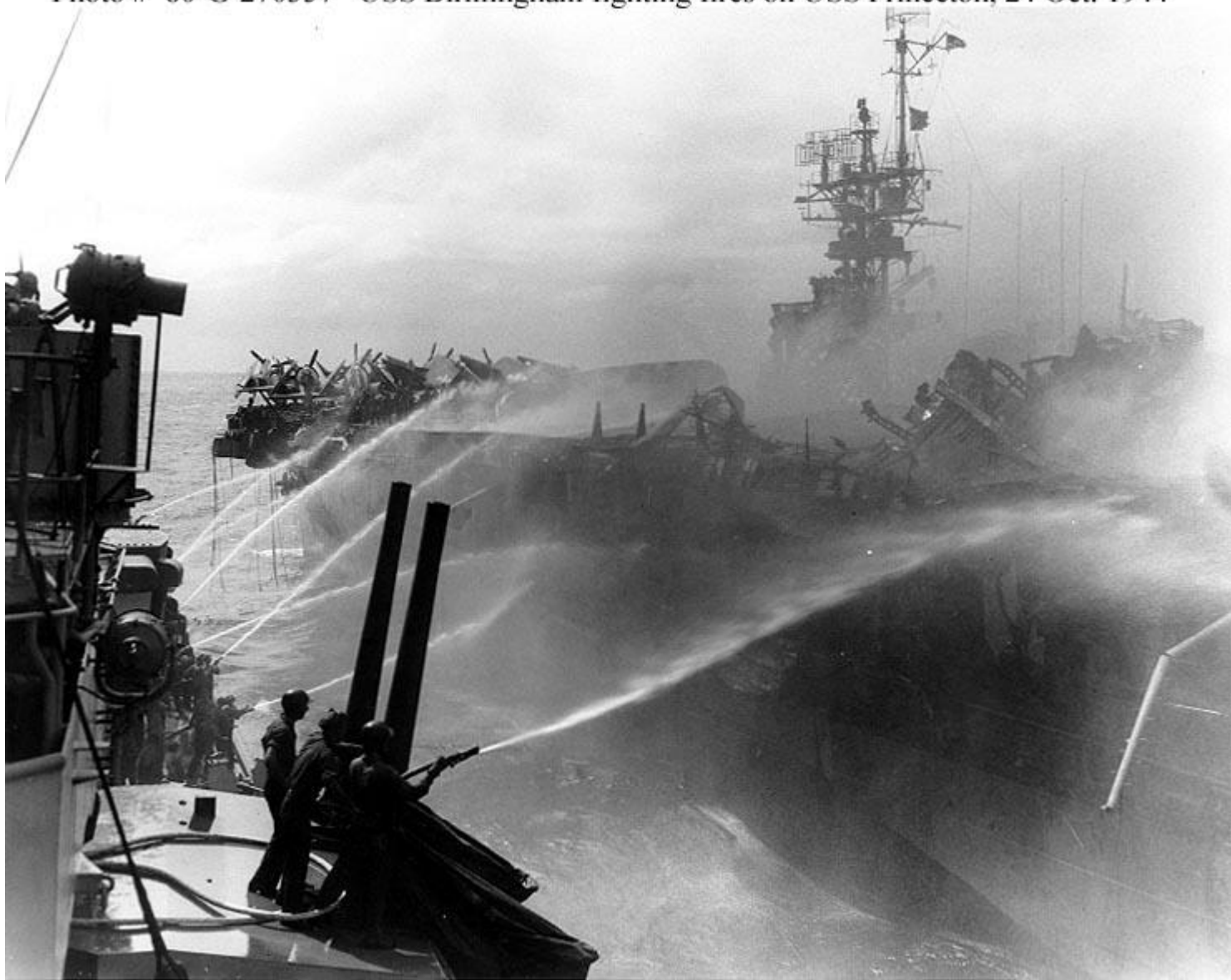
Photo # 80-G-270357 USS Birmingham fighting fires on USS Princeton, 24 Oct. 1944